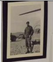
With M*A*S*H units in Korea and Vietnam