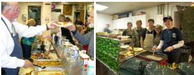
Mother's Day / VE Day Celebration 2011

Sponsored by St. Nicholas Cathedral designated the War Memorial Shrine of the Orthodox Church in America through a gift from a generous prior-service benefactor. All are welcome. Veterans go to the head of the line!