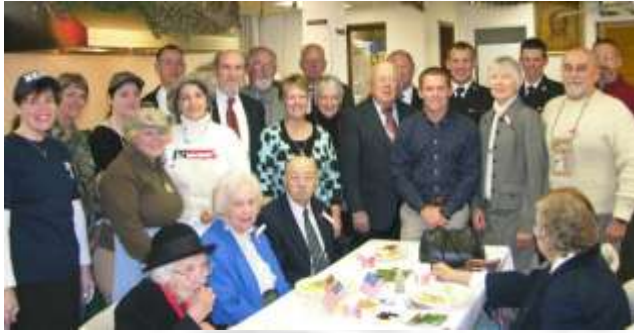
Founding members of the St. Nicholas Veterans Guild November 2010 (Veterans Day)