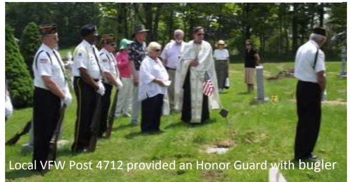
Local VFW Post 4712 provided an Honor Guard with bugler